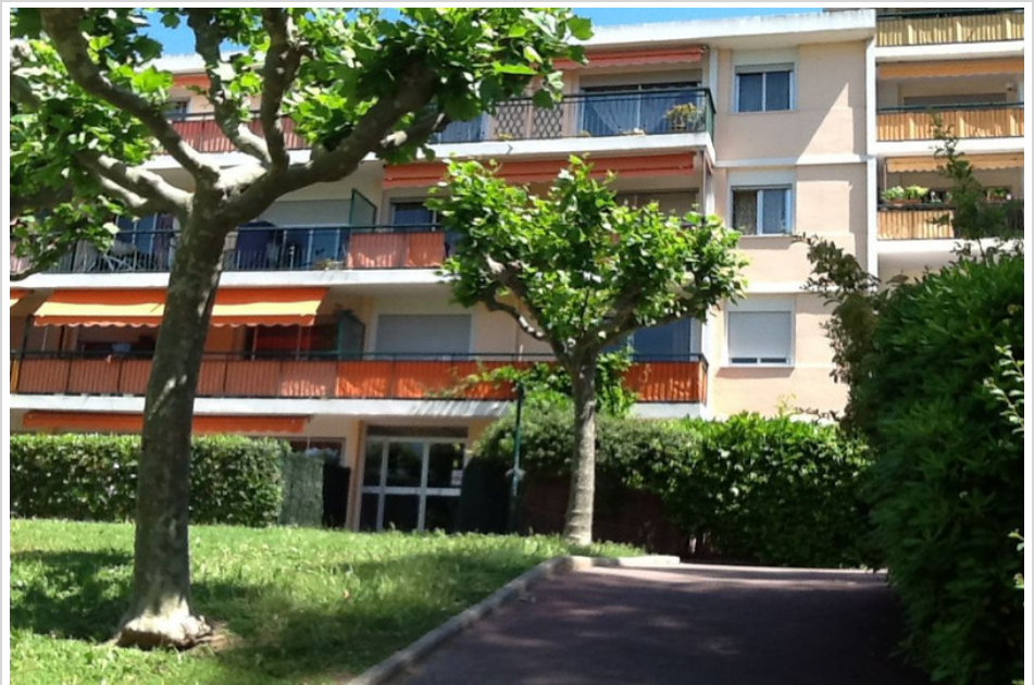
Apartment 1501 Antibes