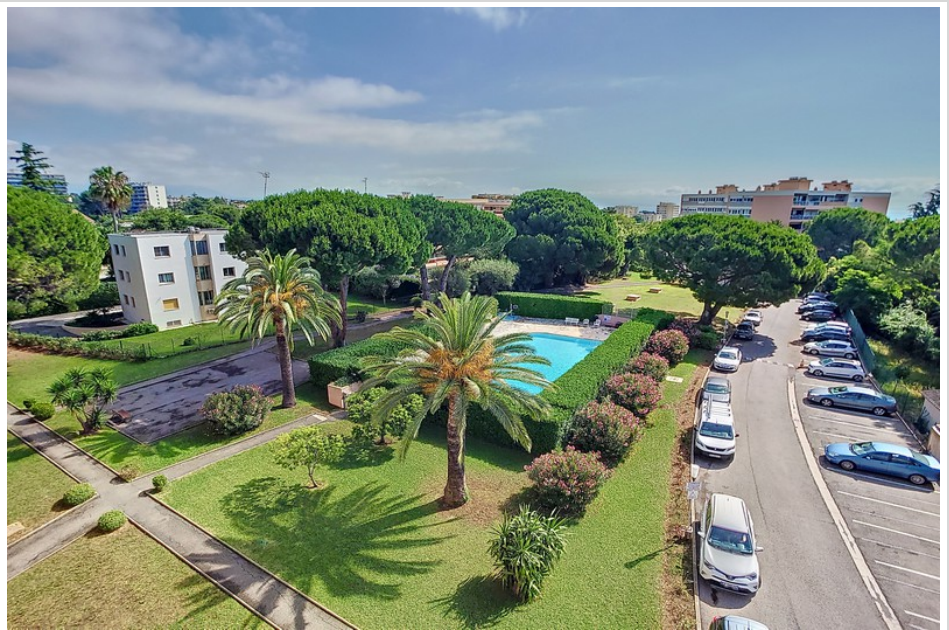
Apartment 138 Antibes