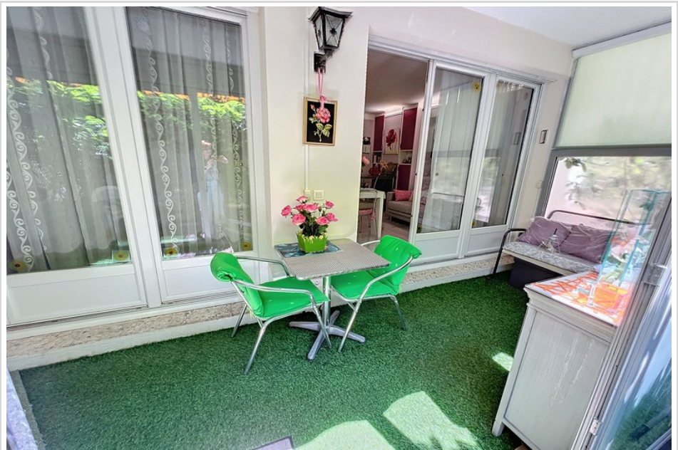
Apartment 1317 Cannes

Energy class (dpe) : D - Emission of greenhouse gases (ges) : D Document non contractuel - 22/12/2024