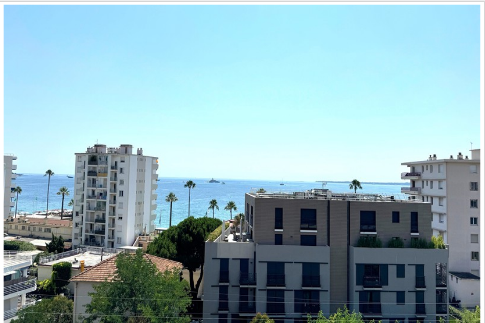
Apartment 373 Antibes

Fees paid by the owner, well condominium(52 lots in the condominium), annual current expenses 3 600 € (300 € monthly), no current procedure, information on the risks to which this property is exposed is available on georisques.gouv.fr