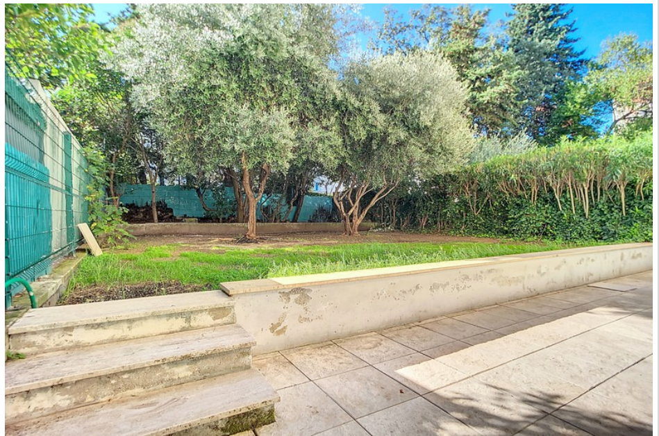
Apartment 137 Antibes

Fees paid by the owner, well condominium, annual current expenses 1 506 € (126 € monthly), no current procedure, information on the risks to which this property is exposed is available on georisques.gouv.fr