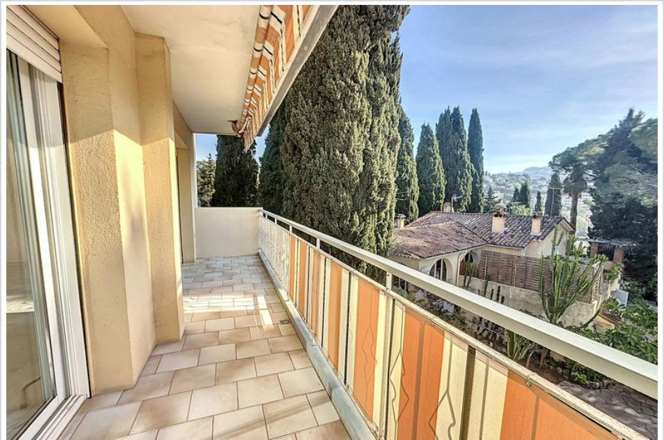
Apartment 1328 Le Cannet

4,76% VAT of fees paid by the buyer (299 000 € without fees), well condominium (3240 lots in the condominium), annual current expenses 3 240 € (270 € monthly), no current procedure, information on the risks to which this property is exposed is available on georisques.gouv.fr